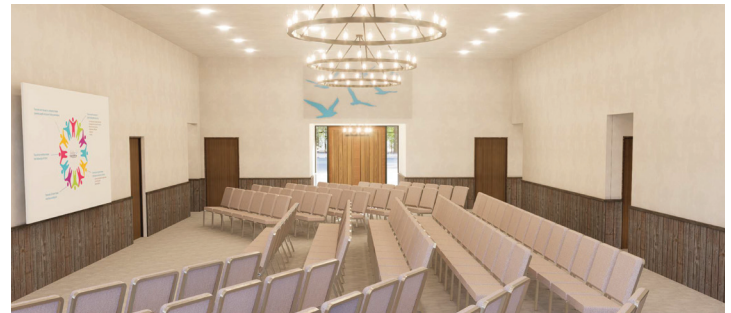
BARN IMPROVEMENT , complete with furniture, A/V equipment, café mini kitchen, bathrooms, small group meeting rooms, and an auditorium for workshops and larger group gatherings.